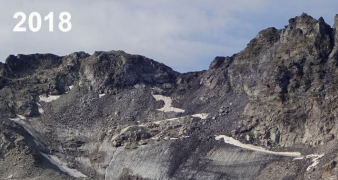
Pizogletscher, E Switzerland.