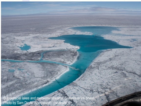
Supraglacial lakes and meltwater streams, Greenland Ice Sheet.