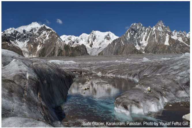
Biafo Glacier, Karakoram, Pakistan.