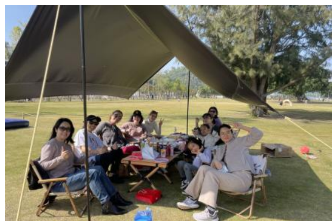
Picnic in Haitian Park with international students