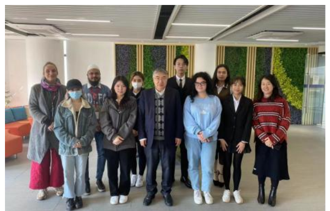
Contemporary China Lecture with international students