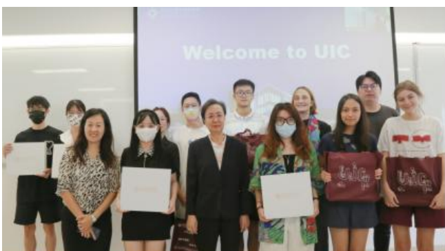
Orientation for international and exchange-in students