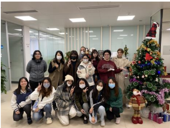
Christmas decoration with international and exchange in students