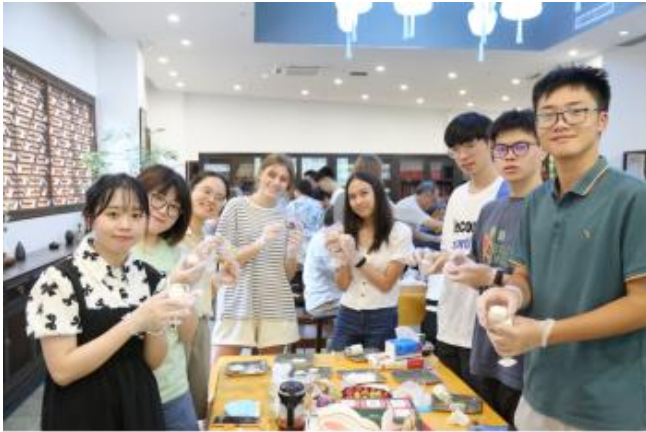
Mid-Autumn Festival, exchange in students and international students

Exchange students will be able to join a variety of activities together with all other inbound students: three-day orientation, experiential learning activities, traditional cultural field trips, company visits and Contemporary China lectures as well as cultural sharing workshops.