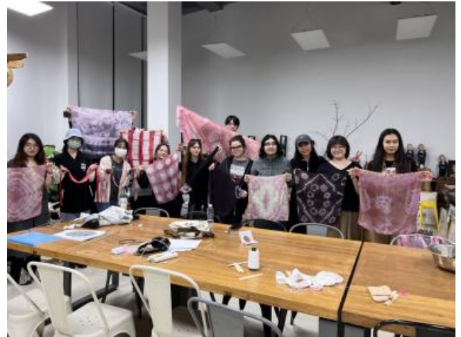
Natural Dye Experiential Workshop