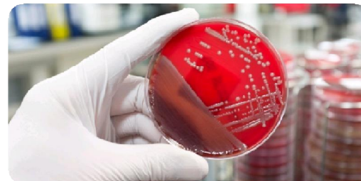
Infectious Diseases (2014-2017)