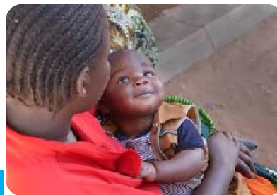
Maternal and child health (2016-2017)