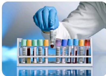
Human biomonitoring (2016-2017)