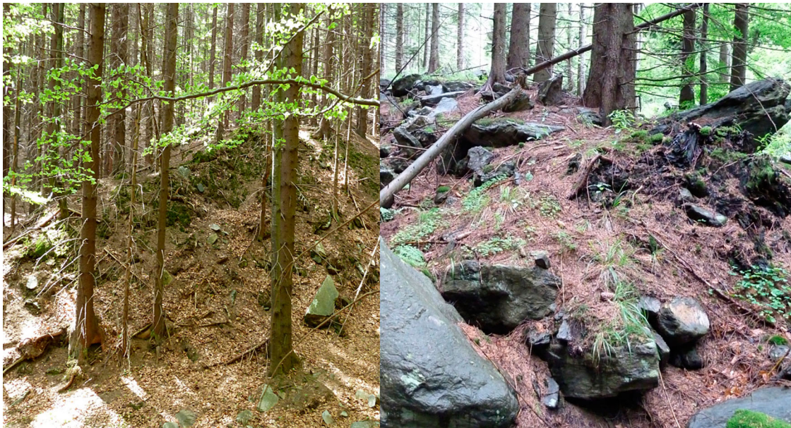
Figure 3. Debris flow accumulations in the Keprnický potok catchment (4; on the left) and the Divoký důl catchment (9; on the right; both photo M. Křížek).

digital terrain model and named according to the GEONAMES database (The State Administration of Land Surveying and Cadastre). The roads, forests and buildings have been visualized by the OpenStreetMap data. The colours used in the map are those commonly used in topographic maps (Kraak & Ormeling, 2013). Highlighted features (debris flow paths and accumulations) are visualized in violet and orange to be easily visible on the basic map. The Projected Coordinate System used in the map is the Czech National System S-JTSK – Krovak East-North. Collected spatial data are visualized in the presented map, which contains two categories of debris flow spatial data in the study area: