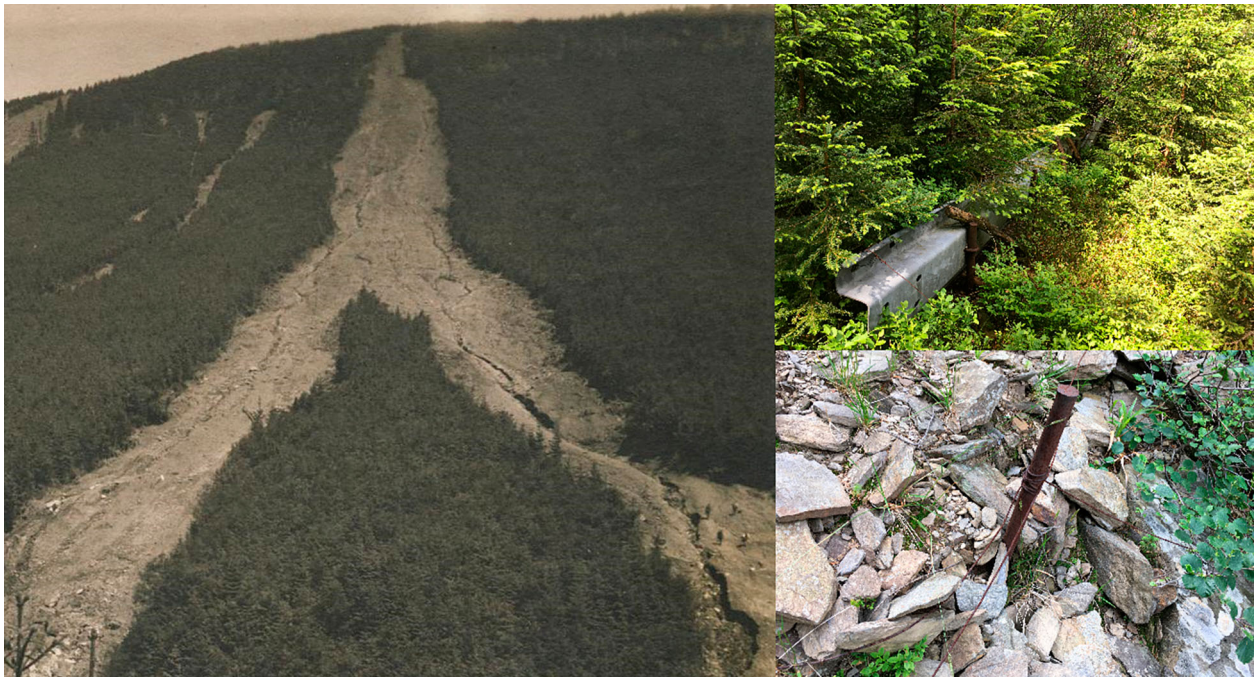
Figure 2. Debris flow paths in the Hučivá Desná catchment (6) in the year 1921 (old photograph from a postcard on the left), and technical protection built in debris flow paths in order to stabilize the slopes (on the right).

1813 (Schön, 1938 in Gába, 1992). The forest management authorities often tried to build erosion control fences in the debris flow paths (Figure 2) and began to grow a non-indigenous dwarf pine ( Pinus mugo ) to stabilize the convex slopes above the timberline where starting zones of debris flows are usually located (Tremml, Wild, Chuman, & Potůčková, 2010). Even so, some debris flows still occur repeatedly in their paths (Gába, 1992, 2014; Sokol, 1965; Tichavský & Šilhán, 2015). As the occurrence of debris flows is still a problem in forest management and risk prevention at the present time, the spatial distribution of debris flow paths needs to be examined, yet there has been no cumulative study or map produced constraining these problems.